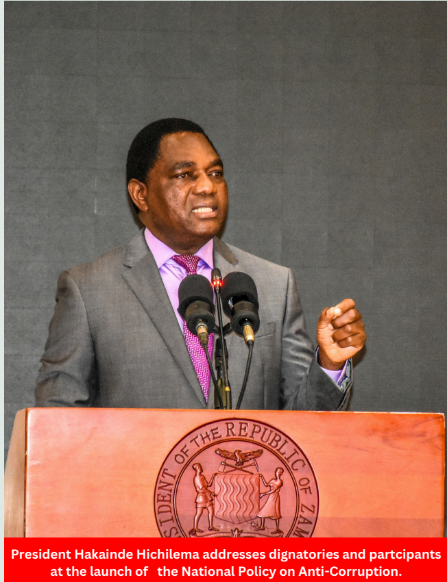
President Hakainde Hichilema addresses dignitaries and participants at the launch of the National Policy on Anti-Corruption.

President Hakainde Hichilema has emphasized the necessity of combining prosecution with asset recovery in the ongoing fight against corruption in Zambia.