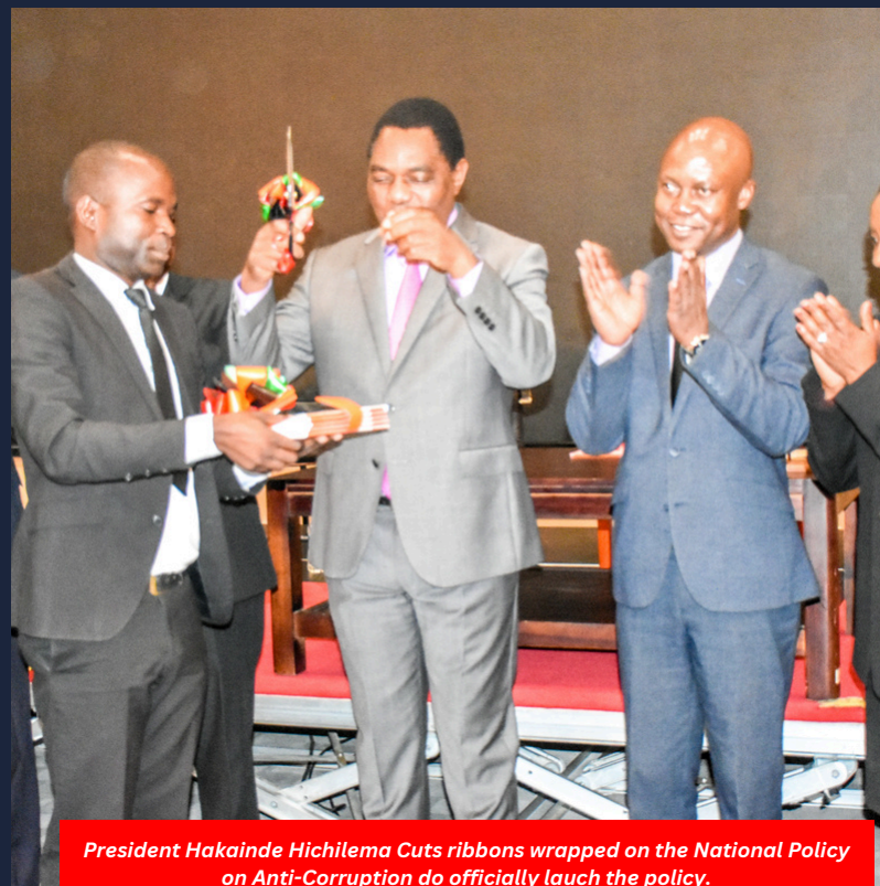
President Hakainde Hichilema Cuts ribbons wrapped on the National Policy on Anti-Corruption do officially launch the policy.

The President reassured the public that the government is not relaxing in its anti-corruption efforts, addressing concerns on social and mainstream media about the perceived leniency.